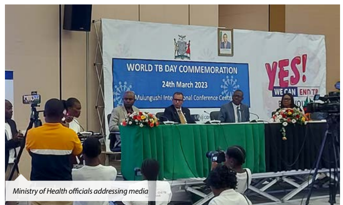
Ministry of Health officials addressing media

The Zambia Medical Association joined the Ministry of Health and other stakeholders in commemorating this important event that was graced by Minister of Health, Honorable. Ms Sylvia T. Masebo, MP at Mulungushi International Conference Centre.