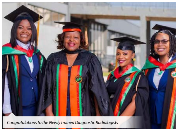
Congratulations to the Newly trained Diagnostic Radiologists