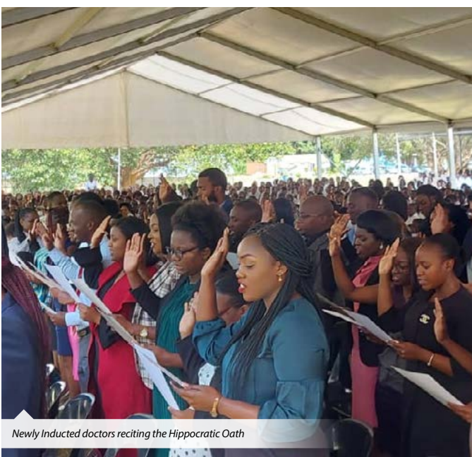
Newly Inducted doctors reciting the Hippocratic Oath