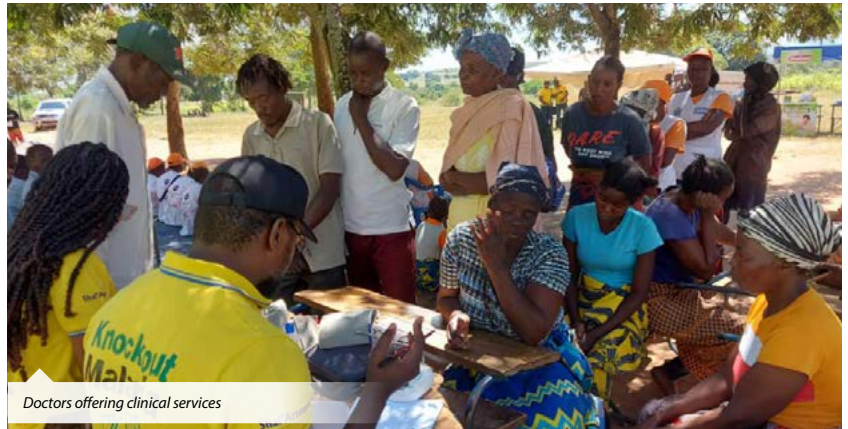
Doctors offering clinical services

ZMA reaffirms its commitment in supporting the government towards the attainment of zero malaria and is open to partner with stakeholders in enlightening and providing health measures to the people of Zambia.