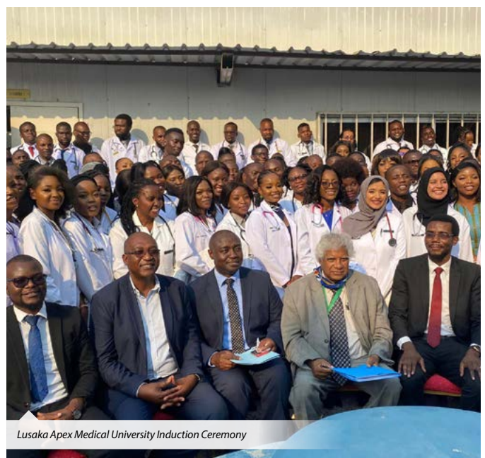
Lusaka Apex Medical University Induction Ceremony