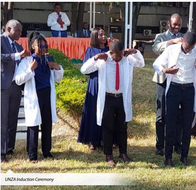
UNZA Induction Ceremony

In the past seven months, ZMA has inducted over 700 medical doctors into the profession. Even with this being a great achievement for the association, it has however come as a challenge for the Zambian government to recruit all personnel. It is based on this that ZMA has been in active engagement with key stakeholders including the private sector to ensure the responsibility is not left to government alone but also have them come on board to participate in recruitment.