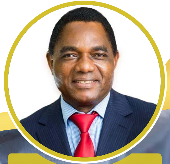
Guest of Honour H.E. HAKAINDE HICHILEMA PRESIDENT OF THE REPUBLIC OF ZAMBIA