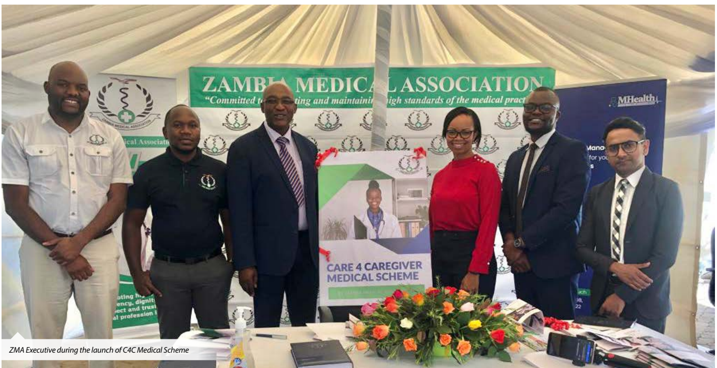
ZMA Executive during the launch of C4C Medical Scheme