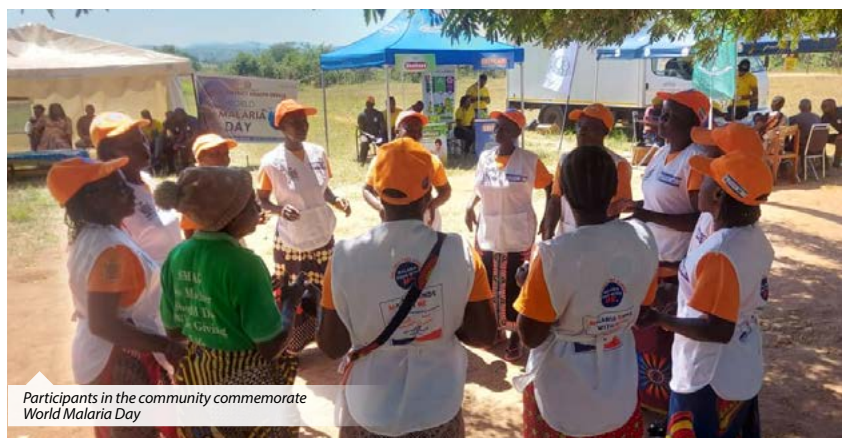
Participants in the community commemorate World Malaria Day