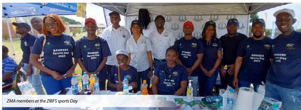
ZMA members at the ZIBFS sports Day