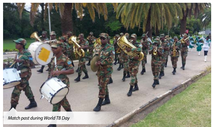
Match past during World TB Day