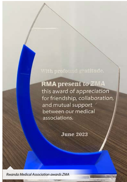
Rwanda Medical Association awards ZMA