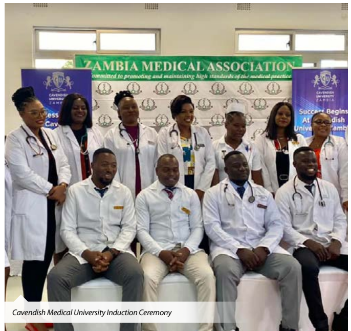
Cavendish Medical University Induction Ceremony